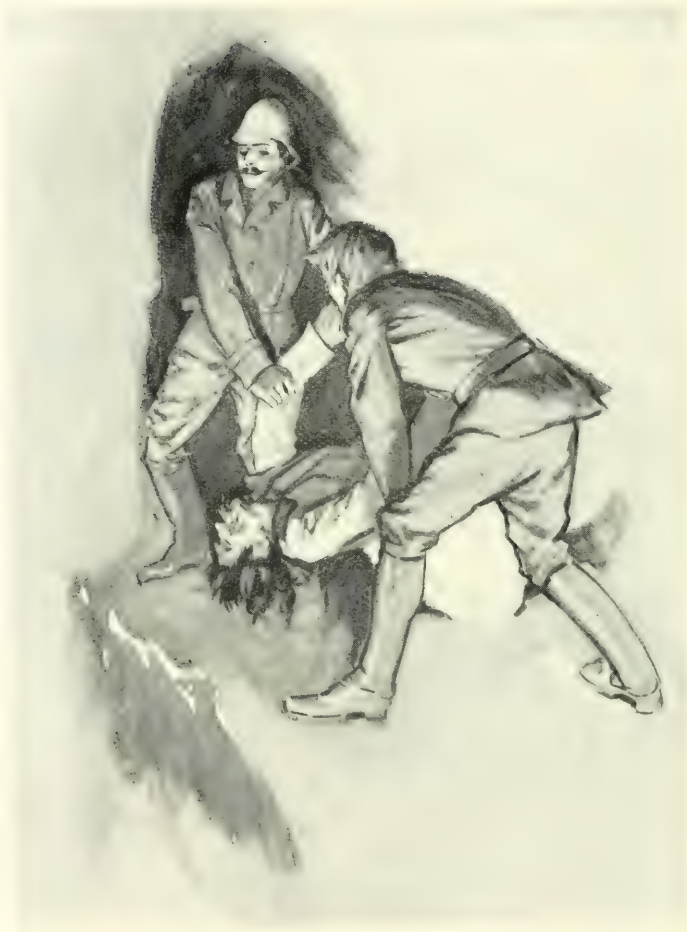
WE TOOK SPIRO'S BODY AND FLUNG IT DOWN.